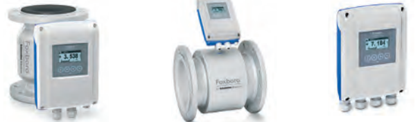
IMT31A Compact 0°-version