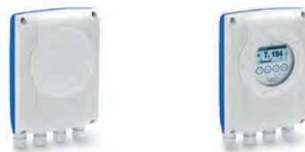
IMT30A without and with display